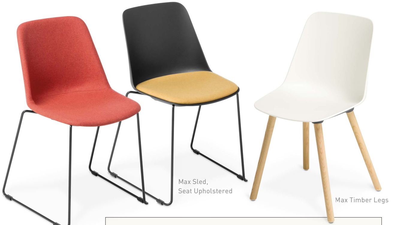
Max Sled, Fully Upholstered